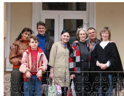
Hearing Program Team in Ivano-Frankivsk, Ukraine

If a child cannot hear, they cannot talk, and without those two major essentials, a deaf student has little chance for a job, a profession, or a chance for "normal" life. This is why we prioritize the list of those getting hearing aids in the following order: (A) Those that are 14 to 17 years old who will be out on the street within months. Every day that a student can hear and talk increases that student's chance for actual survival. (B) Those students between the ages of 10 and 14 years old. (C) Those students between the ages of 4 and 9 years of age who have many months before they are out of the school for deaf. They have the best chance of all.